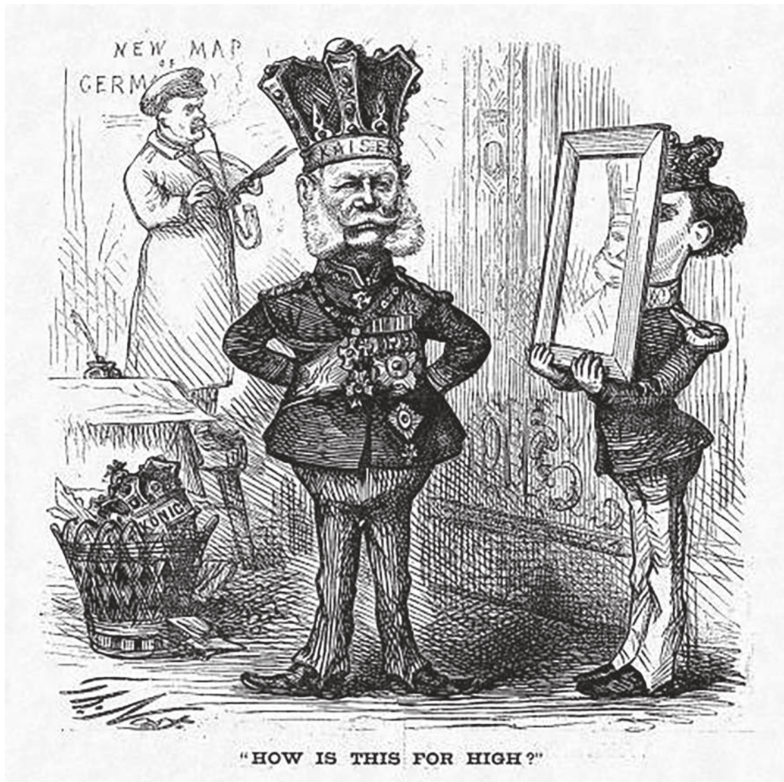
A cartoon published in an American magazine, 7 January 1871. Bismarck is in the background. William's Prussian crown lies in the waste bin.