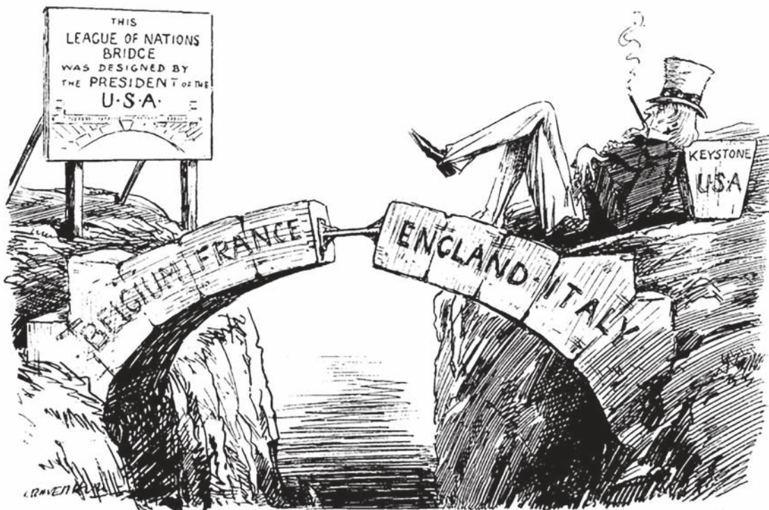
THE GAP IN THE BRIDGE.

A cartoon published in a British magazine, December 1919. The keystone is the stone that locks the structure together.