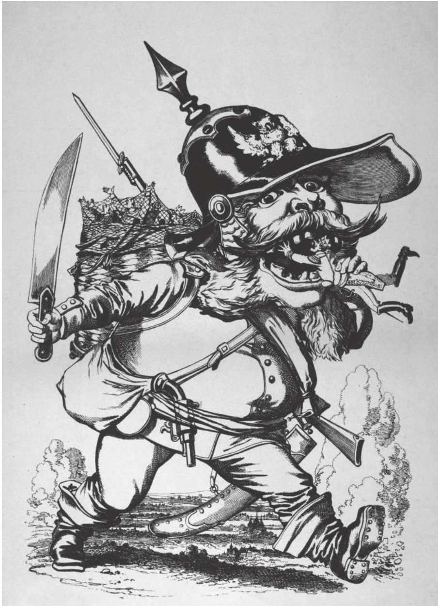
A French cartoon published in early 1867. It is entitled 'The Giant German Ogre'. It shows William and some small figures which represent the princes of North Germany.